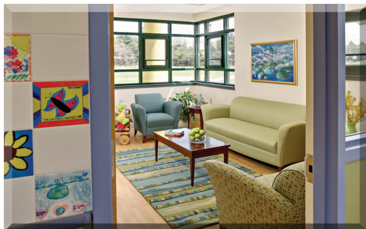
Monmouth County Child Advocacy Center, Freehold, NJ: MCCAC was created as a safe, child-friendly facility for the victims of child abuse and their caregivers. The Family Waiting Room is a comfortable Living Room setting for children and their families awaiting assistance. All seating is upholstered in child-friendly, stain and bacteria resistant fabrics. "The Caring Wall" is a file wall community project designed by children helping children.