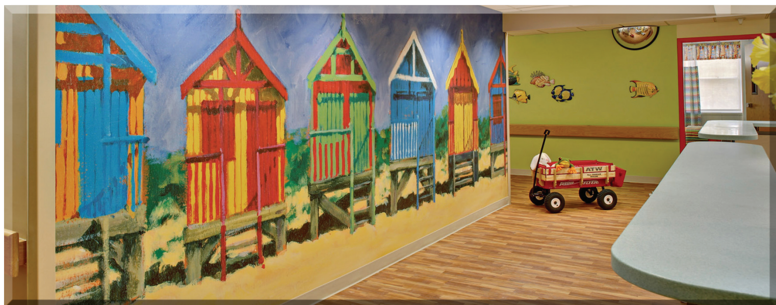
Monmouth Medical Center, Pediatric Unit, Long Branch, NJ: This newly renovated pediatric nurse's station was designed with a bright seaside cabana wall mural and a "boardwalk" wood vinyl floor to complete the beach theme.

Since its founding in 1993, InsabellaDesign of Red Bank, NJ