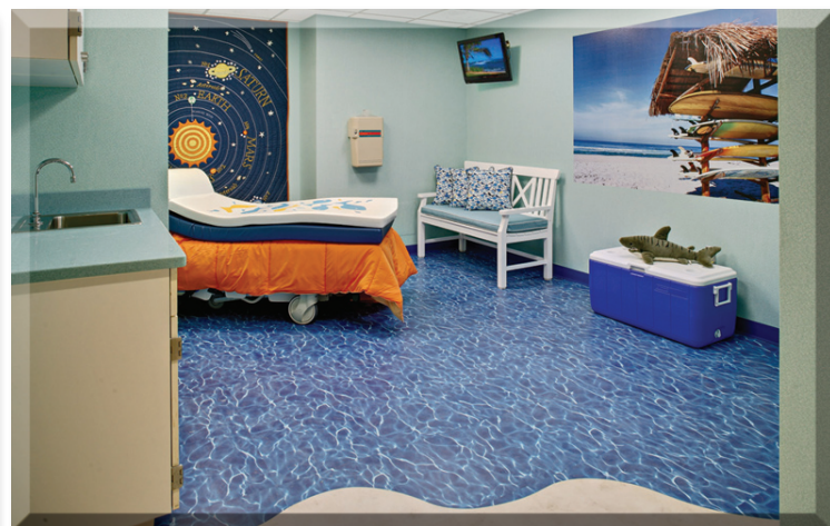
Monmouth Medical Center, Pediatric Unit, Long Branch, NJ: This unique Treatment room was designed for children to "float" on the watery floor tiles with a "sandy" shoreline. A flat screen television playing videos of beach scenes and underwater fish images, a beach wall mural, and a cooler filled with toys, makes it fun for the patients, as well as the parents.